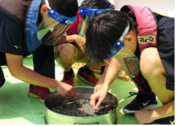
Observation of creatures living on the seabed