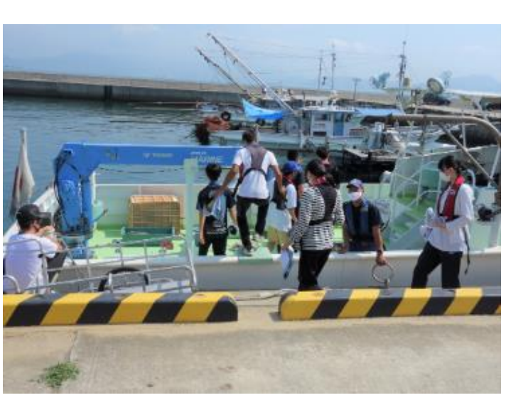
Boarding "Calanus III" for observation