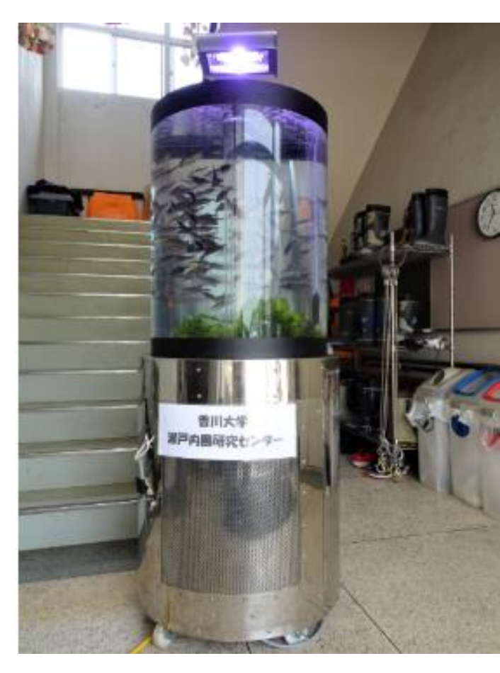
Aquarium for lab