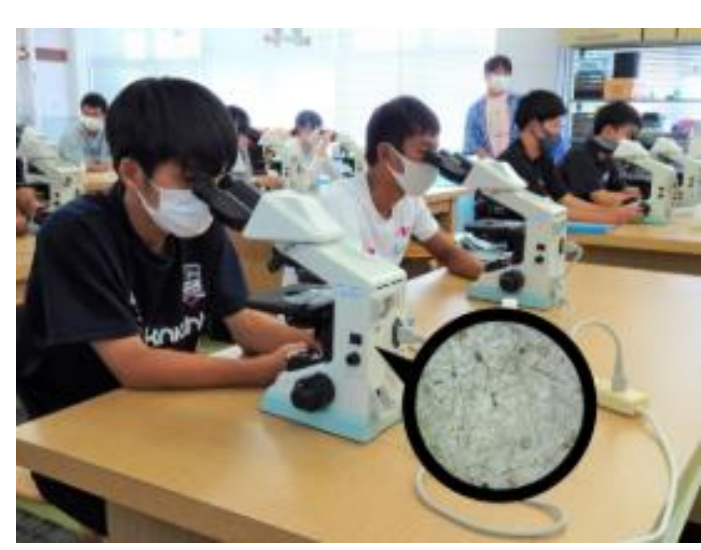
Microscopic observation of ocean plankton