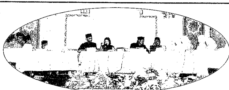
Participants from Brunei Islamic College (L) and SUAMPRIPAD (R)

Organised by the Arabic Language and Mawwad Diniyyah Departments as part of their annual activities, the aims of the quiz were to enhance learning as well as increase the participants' knowledge in Arabic Language and religious subjects through healthy competition.