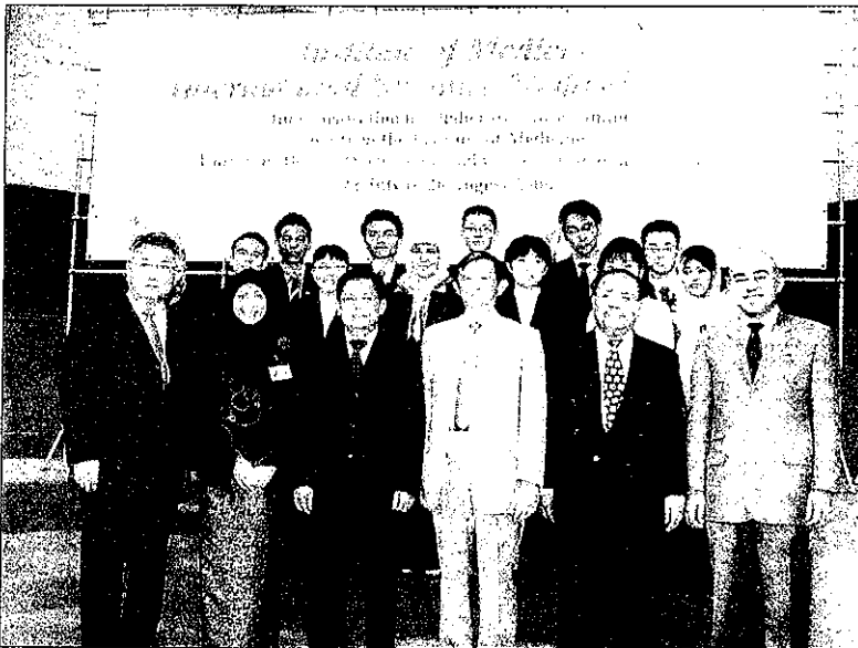
Group photo of the participating students from Japan with Japan's Ambassador to Brunei Darussalam, Acting Vice-Chancellor of UBD and staff of the Institute of Medicine, UBD