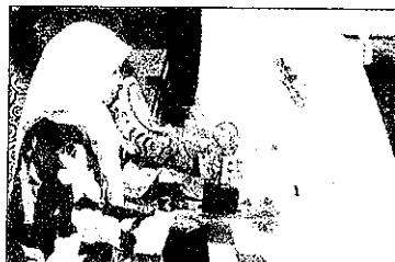
Principal Ustazah Datin Piah presents a trophy and certificate to one of the winners