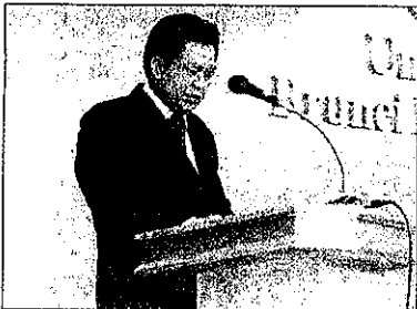
Acting Vice Chancellor of UBD delivers his speech