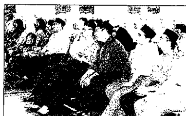
Some of the teachers and students present at the quiz