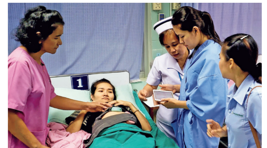
Hospitals in rural areas, such as in the Thai countryside, have also installed the Petit CTG. A pregnant mother's information can be shared with nurses and doctors via smartphones and tablets, enabling quick decisions on whether the mother needs to receive treatment at a hospital offering more advanced care.

Japanese technology, which instigated a revolution in obstetrics and gynecology 50 years ago, helps to save the lives of pregnant mothers and their babies around the world, this time with a lovely handheld device. *