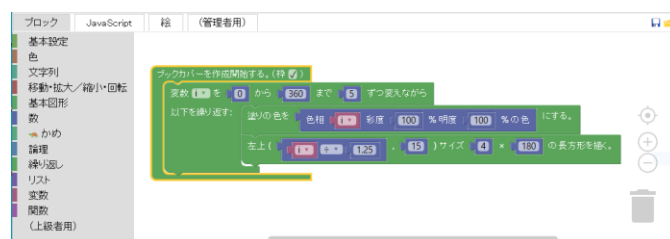
Figure 2: Screenshot of Blockly Editor

We also utilize Blockly ( https://developers.google.com/blockly/ ) (Figure 2) for the user interface.