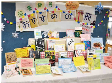
Exhibition of Library collections