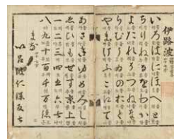
Iroha , a mid-15th century textbook for Korean learners of the Japanese language