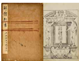
Kaitai Shinsho , a medical text translated into Japanese during the Edo period from the Dutch-language translation of Kulmus' German Anatomische Tabellen