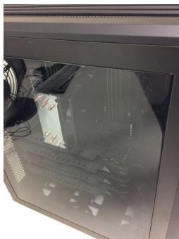
Figure 3: Deep-learning machine

We applied the proposed methods to 256 \times 256 Shepp–Logan phantom image in Fig. 1, which imitates a skull. Since the original image is 256 \times 256 pixels, we need to solve the convex optimization problems with the number of variables 65,536. Using the continuous-time dynamical system (Cont), conjugate gradient method (CG), conjugate gradient method with nonnegative constraint (Nonneg), conjugate gradient method with box constraint (Box), and nonlinear conjugate gradient method (PRP), the image reconstruction was carried out as shown in Fig. 2. The reconstructed image obtained from the nonlinear conjugate gradient method is shown in Fig. 1, which is visually almost same with the original image. Table 1 shows the comparison of computational time, in which the conjugate gradient method with box constraint is 300 times faster than the continuous-time dynamical system.