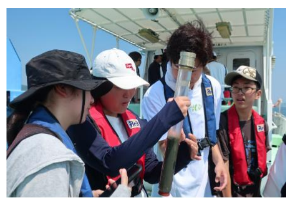
Collection of seabed sediments