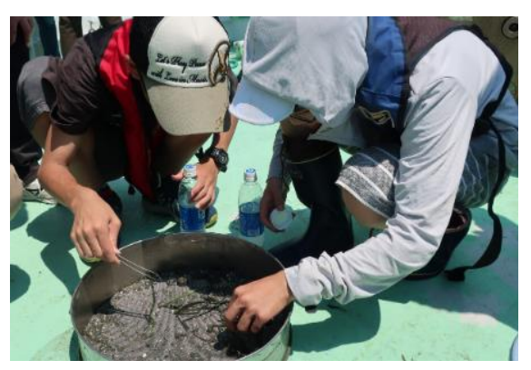
Observation of organisms living in and on the seabed