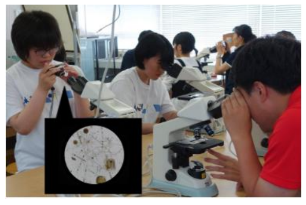
Microscopic observation of plankton