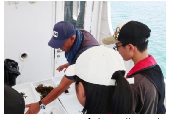
Commentary of the collected creatures