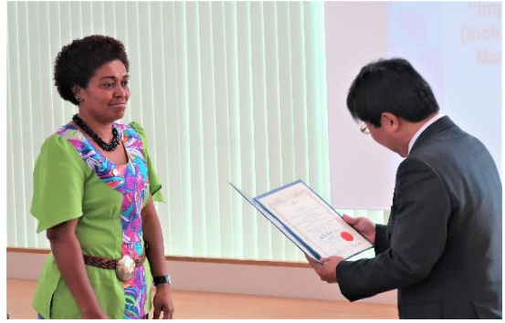
The diploma conferment