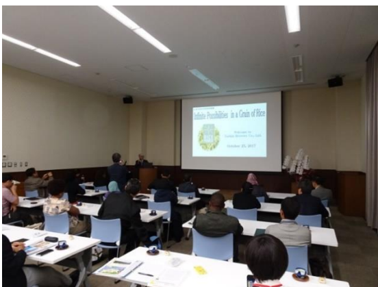
Visit and Lecture: Yushin-Brewer Co. Ltd.