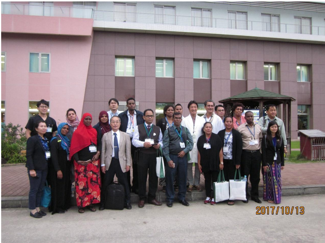
In front of Kameda Medical Center with the history of 350 years