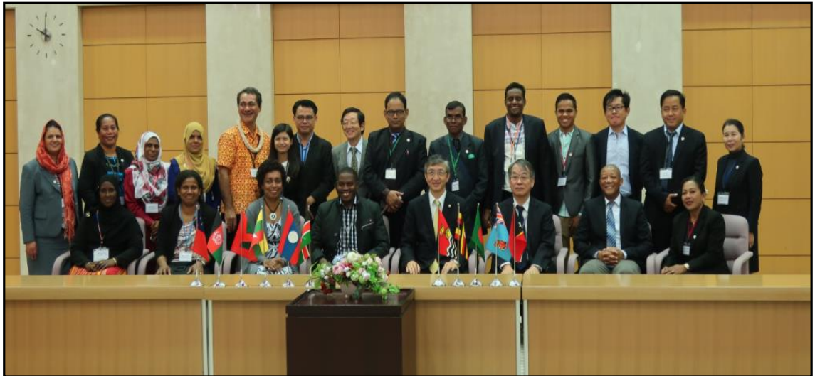
Courtesy call on the deputy governor of Kagawa Prefecture