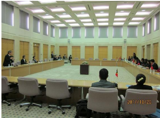
Courtesy call on the governor of Kagawa Prefecture