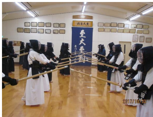
Cultural exchange and experience with Kendo club of Kagawa Univ.