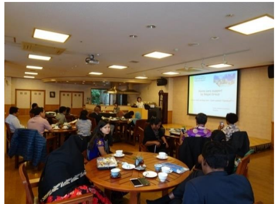
Visit and Lecture: Special nursing home Kiyama