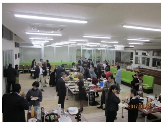
Exchange party with parties concerned