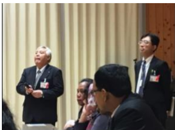
Visit: Tono city maternity home "Net cradle"