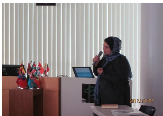
Action plan presentation