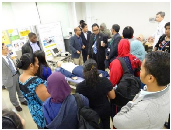
Visit: Medical skills laboratory