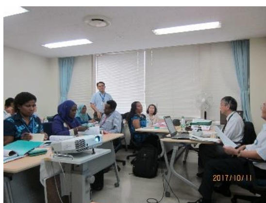
Self introduction of participants