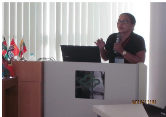
Action plan presentation