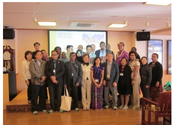
Group photograph at Special nursing home Kiyama