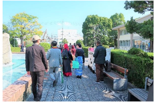
On their way home