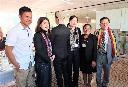
Farewell lunch party