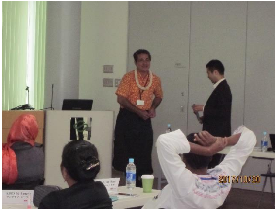
Inception report presentation