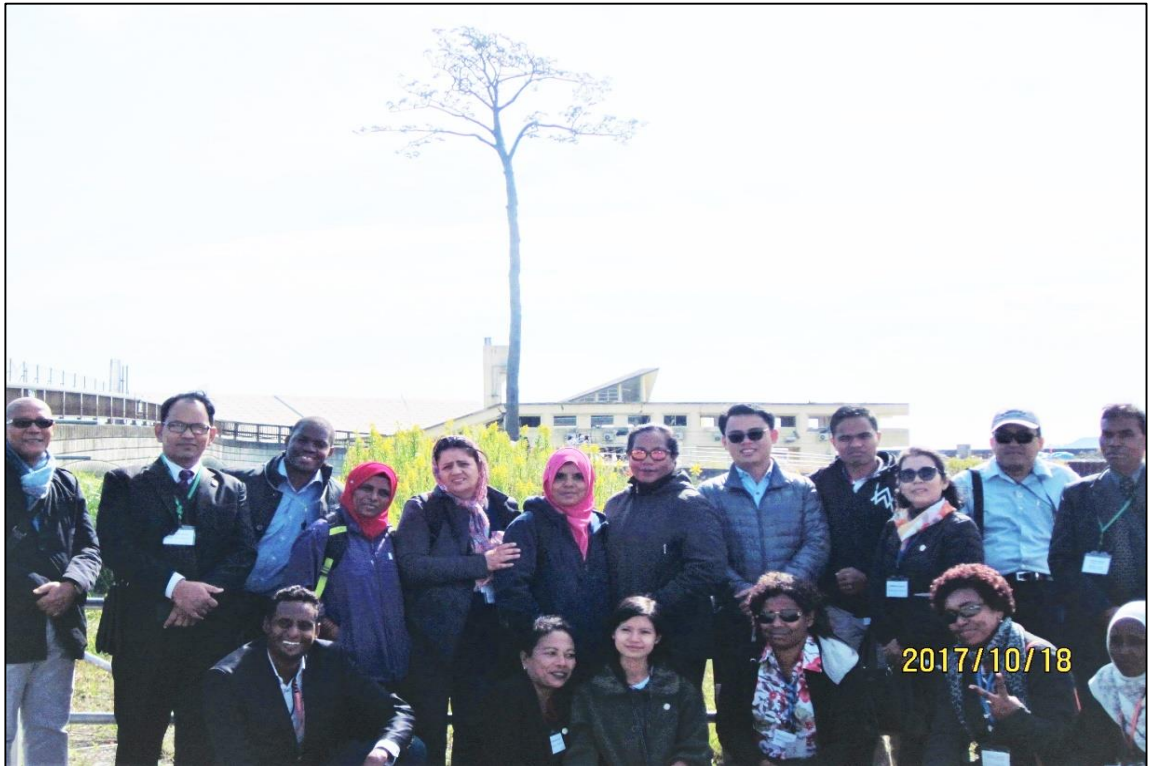
In front of "miracle pine" in Rikuzentakata