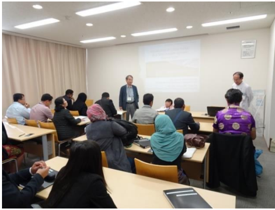
Visit and Lecture: SUE Hospital