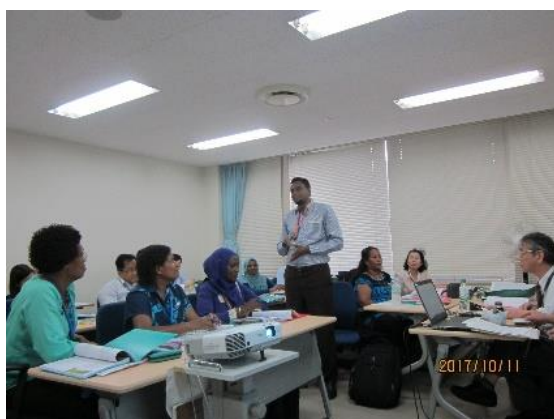
Self introduction of participants