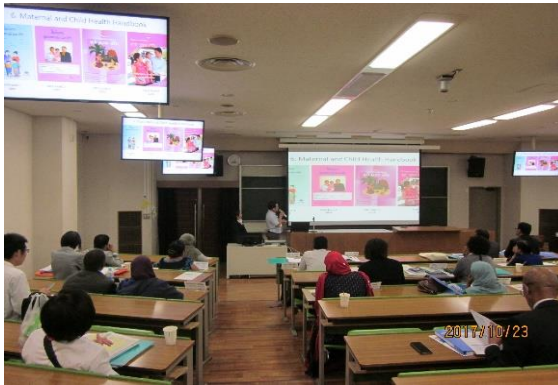
Inception report presentation