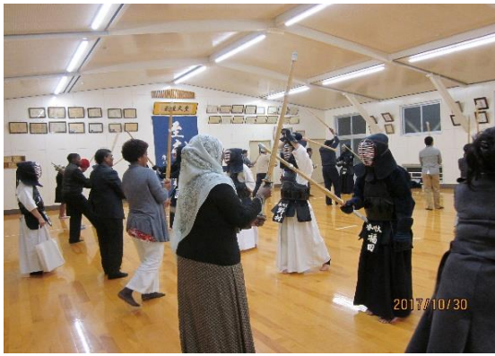
Cultural exchange and experience with Kendo club of Kagawa Univ.