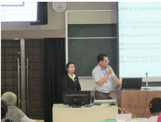
Inception report presentation