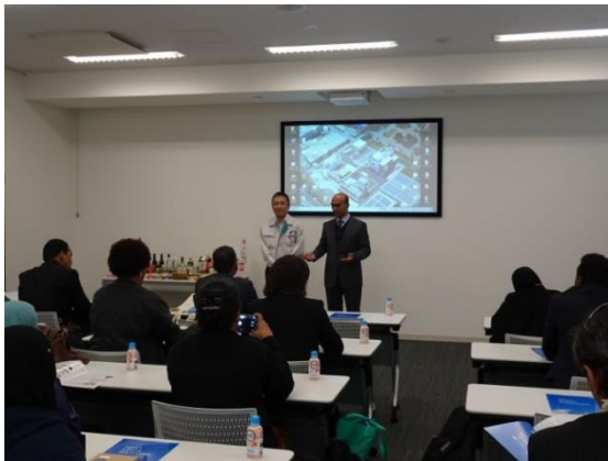
Visit and Lecture: Matsunani Chemical Ind. Co., Ltd.