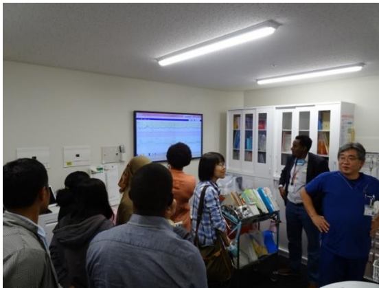
Visit and Lecture: Shodoshima central hospital