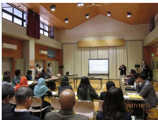
Visit: Tono city maternity home "Net cradle"