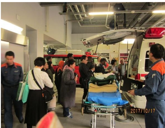
Visit: Tono city disaster prevention center