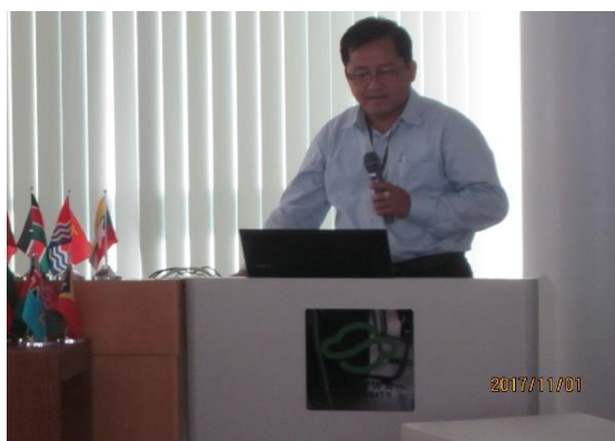
Action plan presentation