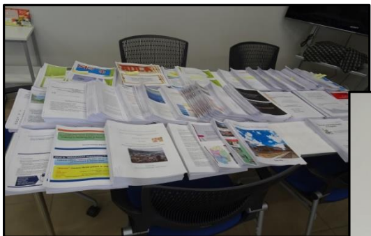
Handouts and files