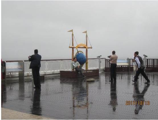
UMIHOTARU parking area, on the way to Kameda Medical Center

Visit : On the way to Kameda Medical Center, visit Tokyo and local cities to understand Japanese life and culture