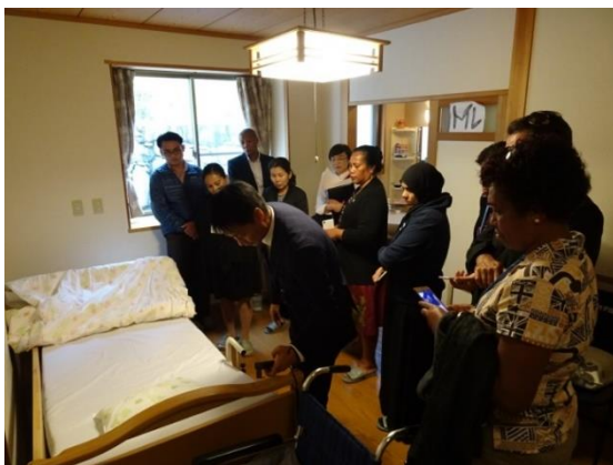
Visit Special nursing home Kiyama