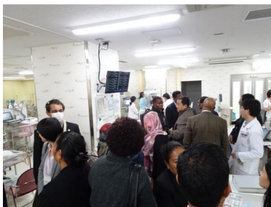
Visit: Kagawa Univ. Hospital