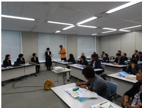
Lecture: Maternal and child health in Kagawa Prefecture