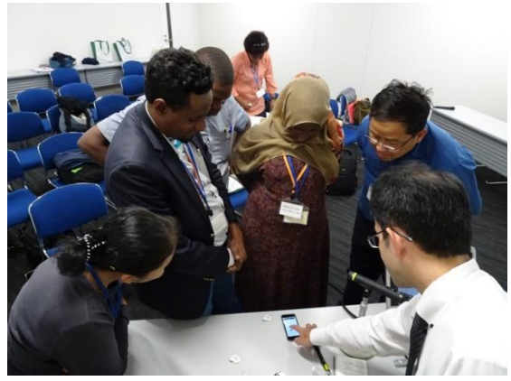
Demonstration of “duranta”