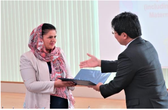
The diploma conferment