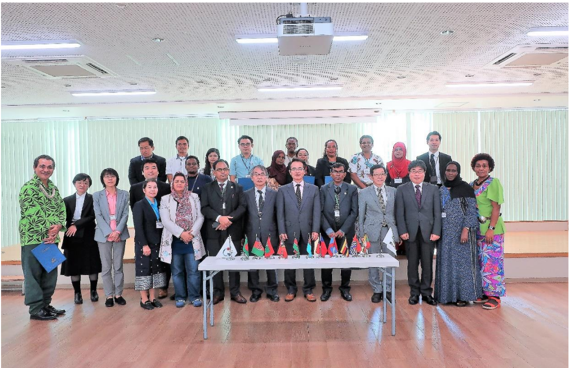
Final group photograph of this program