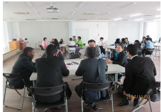
Discussion in each group