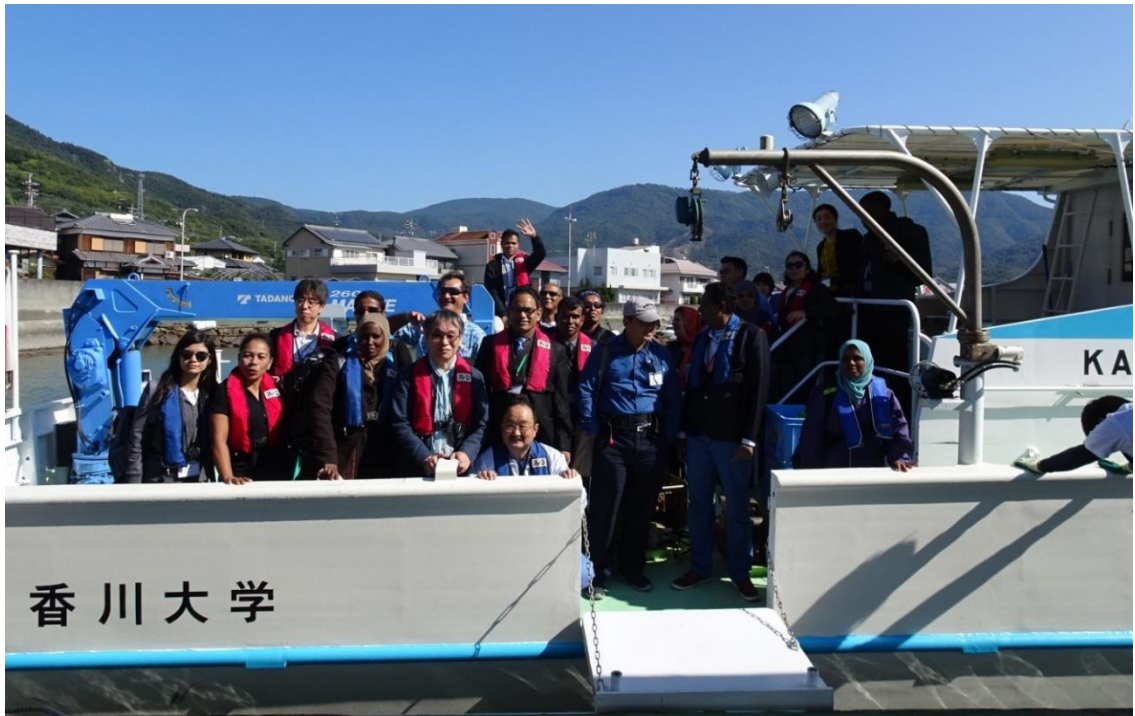
Heading to Shodoshima island, boarding research vessels Calanus III owned by Seto Inland Sea Regional Research Center, Kagawa Univ.