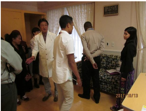
Visit: Kameda Medical Center