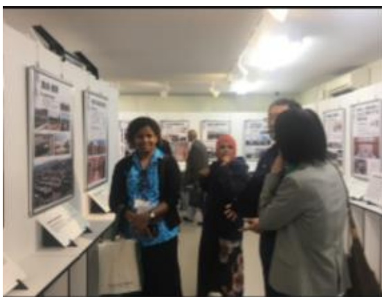
Explanation about the Great East Japan Earthquake