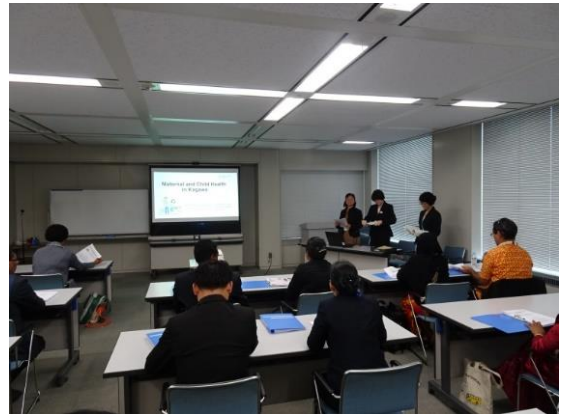
Lecture: Maternal and child health in Kagawa Prefecture