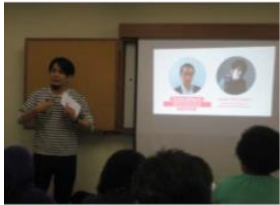
Lecture: NTT DoCoMo/Hakuhodo, Digital mother & child health handbook