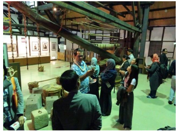
Visit Marukin Soy Sause Museum