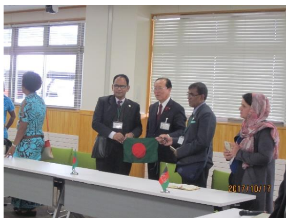
Courtesy call on Tono mayor