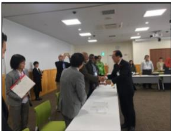
Courtesy call on Tono mayor