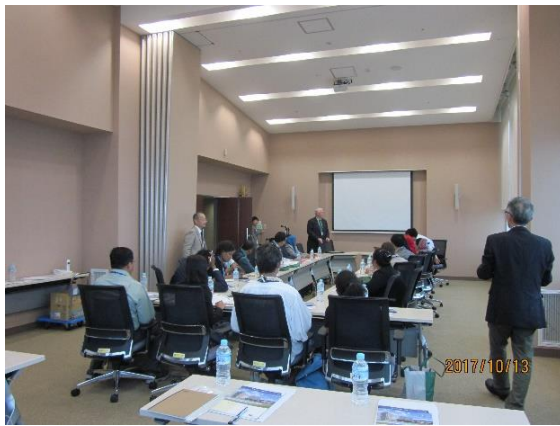
Lecture: Kameda Medical Center