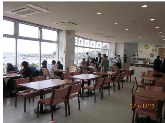
Lunch: Boso Peninsula, roadside rest area