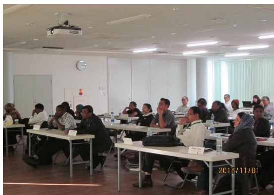
Action plan presentation