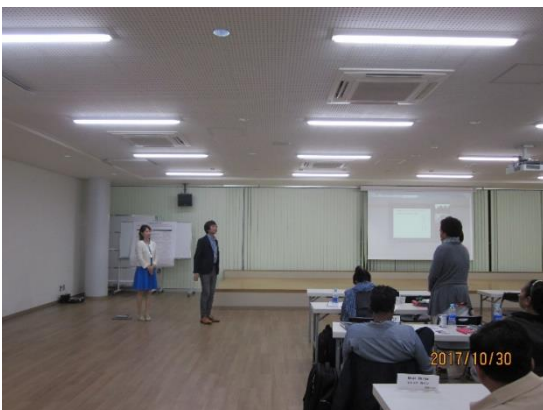
Application of drone: Lecture and Demonstration