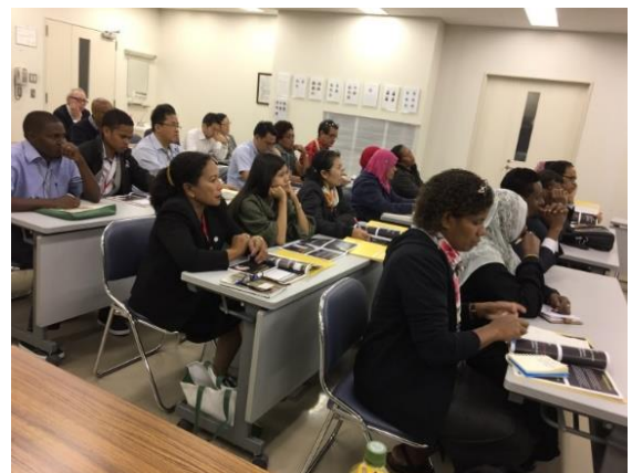
Participants listen to the lecture