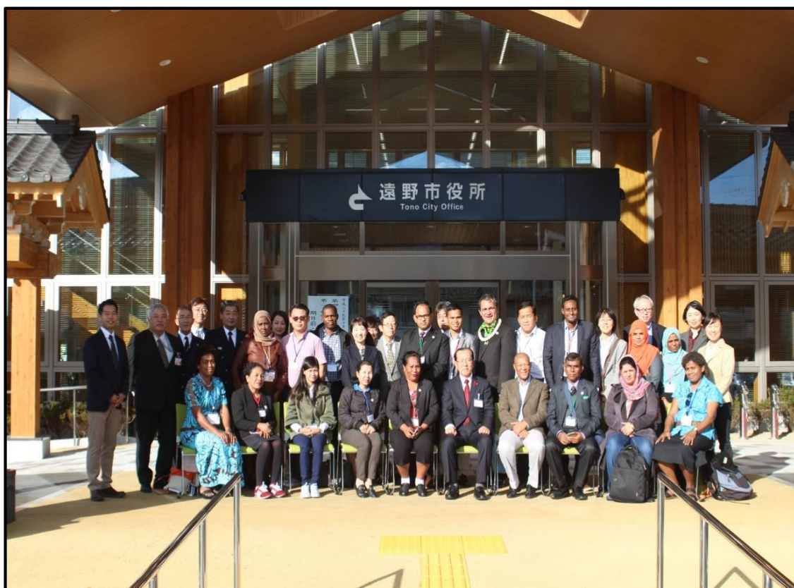
Commemorative photo with Tono mayor