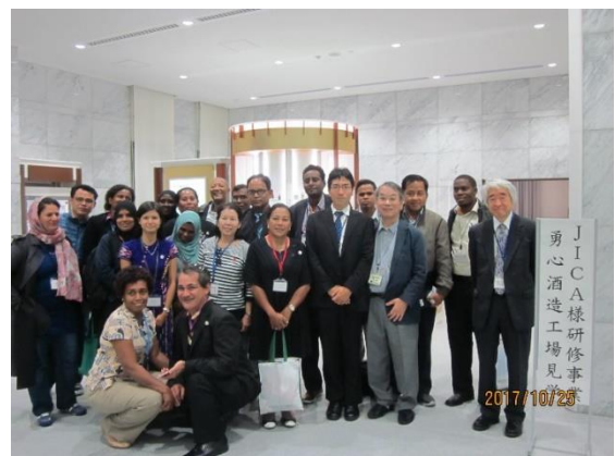
Commemorative photo at Yushin-Brewer Co. Ltd.