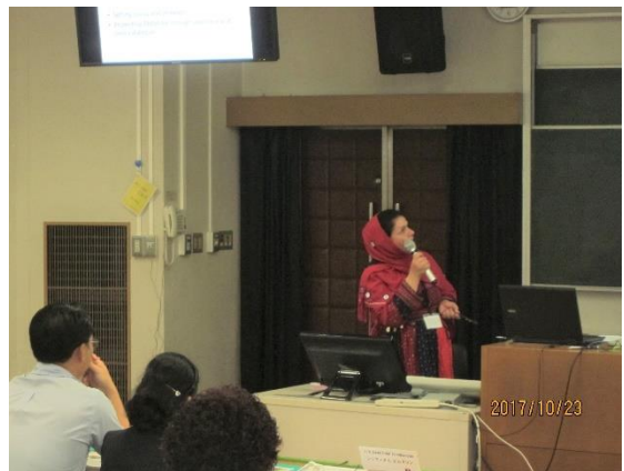
Inception report presentation