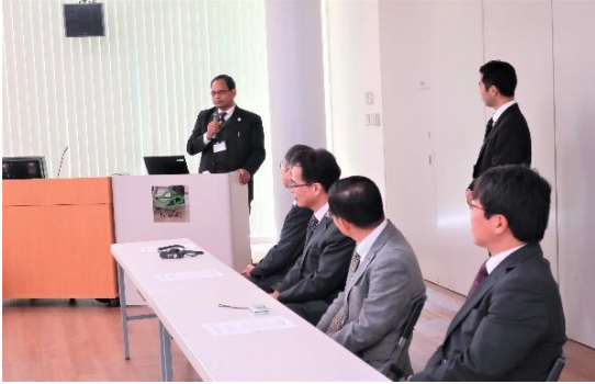
representative express their gratitude