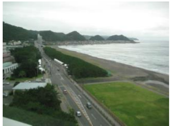
View from Kameda Medical Center