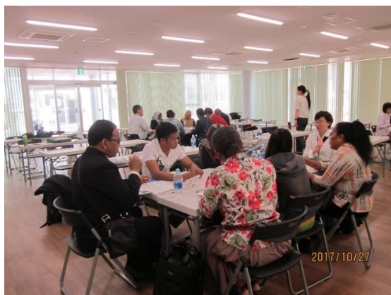
Mutual information exchange with participants