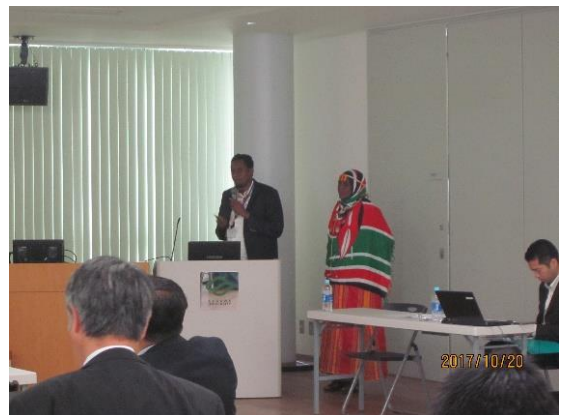
Inception report presentation