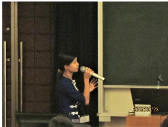
Inception report presentation