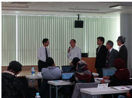
Introduction of advisers of the Action plan