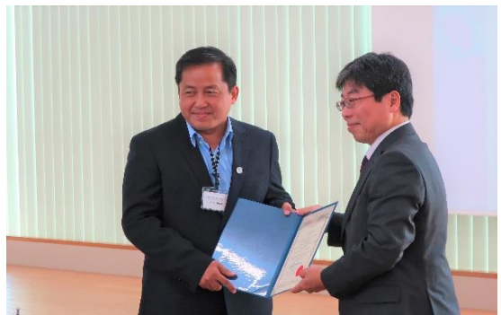
The diploma conferment