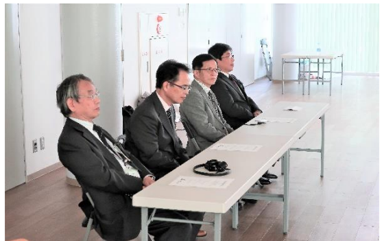
General comment: evaluator