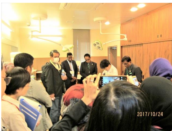
Visit: Kagawa Univ. Hospital