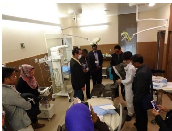
Visit: Kagawa Univ. Hospital