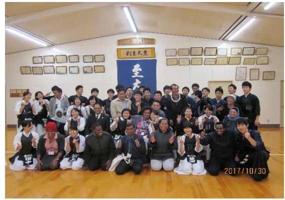
Commemorative photo with Kendo club of Kagawa Univ.