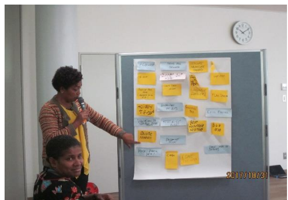
Presentation of the discussion result in the group