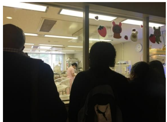
Visit: Iwate Prefectural Ofunato Hospital