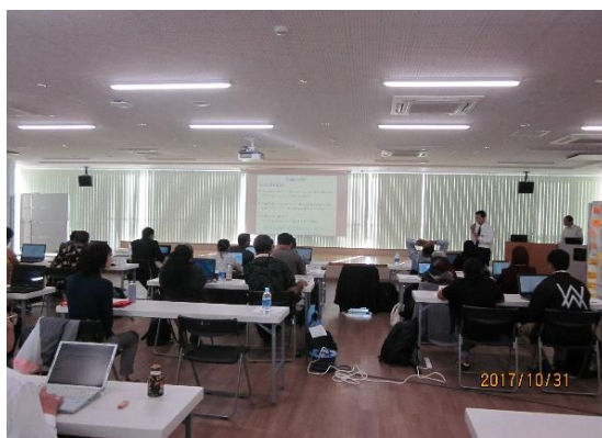
Action plan creation (individual)