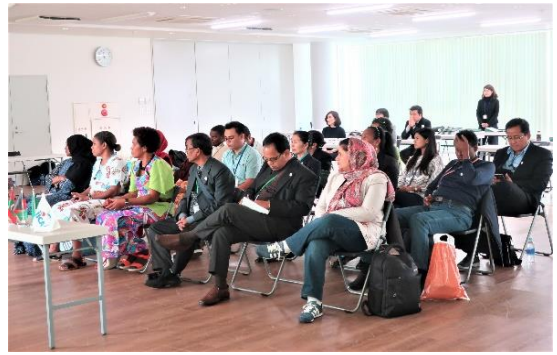
Evaluation meeting: participants