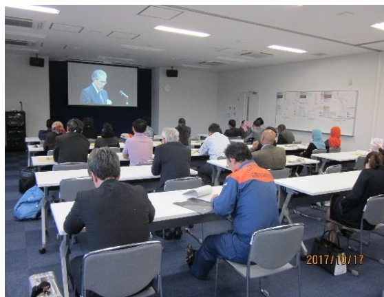
Lecture: Tono city disaster prevention center