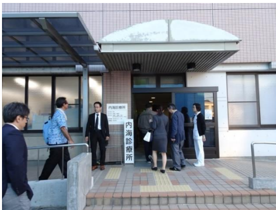
Visit Uchinomi Clinic