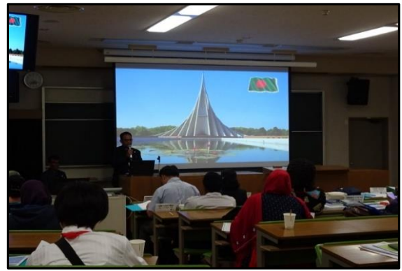
Inception report presentation