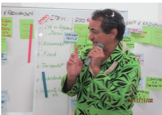
Presentation of the discussion result in the group