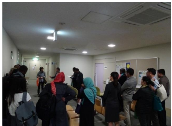
Remote medical examination in Uchinomi Clinic