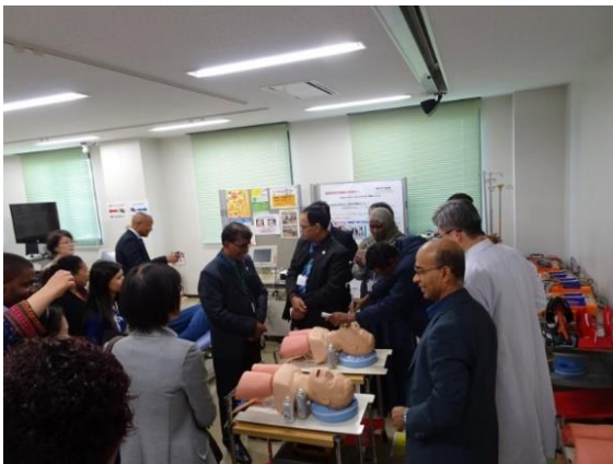
Visit: Medical skills laboratory