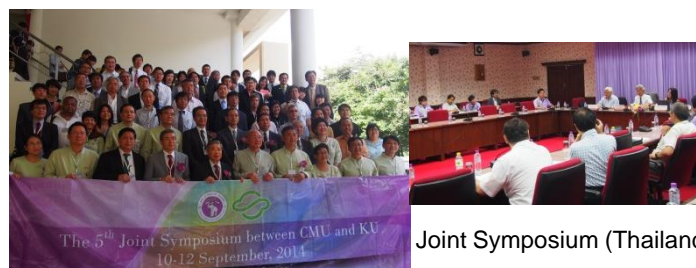
Joint Symposium (Thailand)

As of October 2017, KU has 56 international exchange agreements with overseas universities signed at the university level, and 27 agreements signed at the faculty level. In addition, KU has concluded 4 international agreements of collaboration with institutions and organizations.