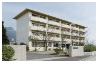
KU Dormitory (Yashima Area)

Students may inquire on this during the application process.