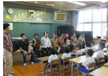
One-Day Trip with Primary School Students