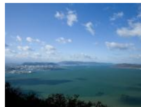
View from Yashima