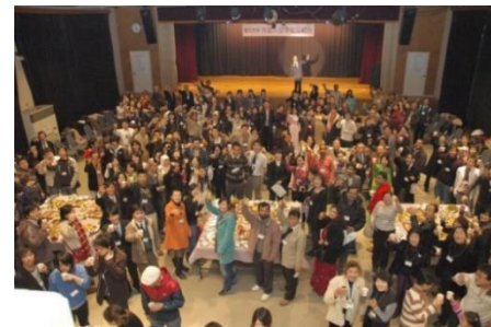
Reception Party for International Students

The above information is tentative and is subject to change.