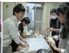
Pan-Fried Dumpling Party